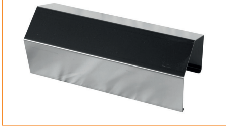
1 weather protection cover for the safety valve with servomotor