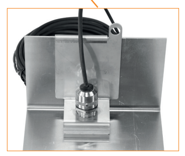
GLF sensor (incl. 5 m cable)