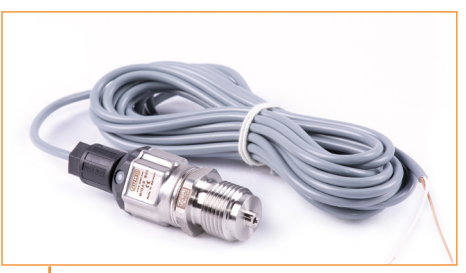
1 pressure sensor ½" in the refrigeration circuit (incl. 5 m cable)