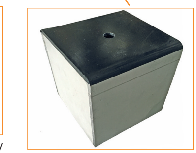
Pedestals or other special solutions - depending on requirements