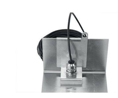
GLF sensor installed